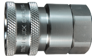
Acero inoxidable 316