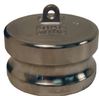
Acero inoxidable 316