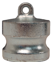
Hierro maleable platinado