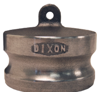
Hierro maleable sin platinar