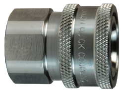
Acero inoxidable 316