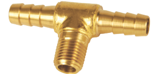
Latón con macho NPTF