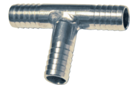
Acero inoxidable 304