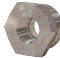
Acero forjado 3000#