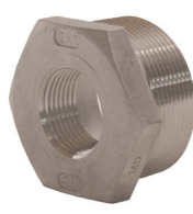
Acero inoxidable 150#