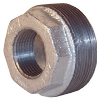
Hierro galvanizado 150#