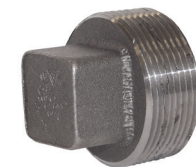
Acero forjado 3000#