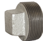
Hierro galvanizado 150#