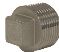
Acero inoxidable 150#