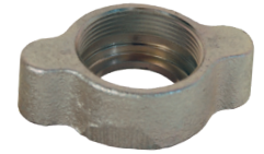
Hierro platinado / acero