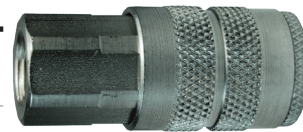
Acero inoxidable 303