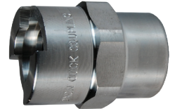
Acero inoxidable 303/316