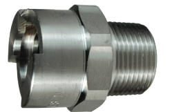
Acero inoxidable 303/316