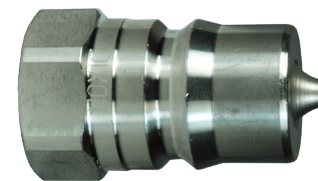
Acero inoxidable 303