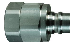
Acero inoxidable 316