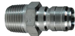
Acero inoxidable 303