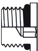
(1) Macho BSPP